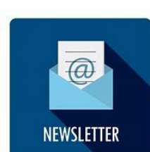
Career Coach Connection