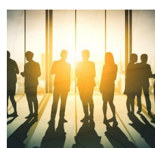
Community of Practice