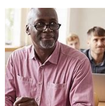
Career Coach Boot Camp